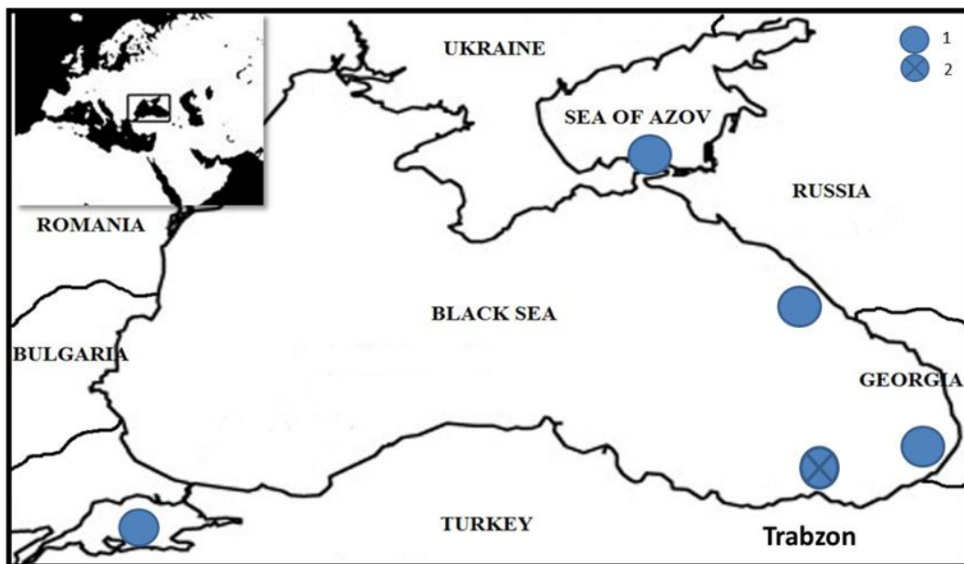
Figure 1. Map of sampling location 1, fishing Season; 2, fishing Season and summer period (Trabzon-Turkey in May)

The reaction was programed on a Thermal cycler (Bio-Rad DNA-ENGINE, PTC 200) with an initial denaturation for 1 minutes at 95°C followed by 30 cycle at 95°C for 1 minute (denaturation) at 50°C 1 minute (annealing) at 70 °C 2 minutes (extension) and final extension at 70°C 10 minutes for D-loop. As a