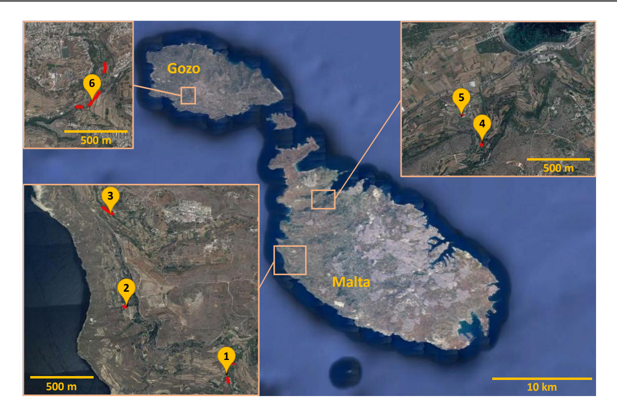
Figure 1. A map (Google Earth, 2019) of the Maltese Islands showing the six sampling locations analysed in this study. Malta: 1. Mtaħleb (n = 30); 2. Ġordania (n = 19); 3. Baħrija (n = 51); 4. San Martin (n = 27); 5. Tilliera (n = 17). Gozo: 6. Lunzjata (n = 32).

dehydrogenase subunit 6 gene (ND6) and the 16S rRNA gene (16S), that include the partial ND6 gene, the complete cytochrome B gene (cytB), tRNA-Ser gene, NADH dehydrogenase subunit 1 gene (ND1), tRNA-Leu, partial 16S gene and few non-coding bases. These two regions were amplified through the use of seven new primer sets (Table 1) that were specifically designed for this study. The mtDNA sequences were amplified in 25 \mu L reaction volumes using 100 ng DNA template; 1× HOT FIREPol® Master Mix [1.5 mM Mg<sup>2+</sup>, 200 \mu M each dNTP, HOT FIREPol® DNA polymerase] (Solis BioDyne, Estonia); and 0.2 \mu M of each primer.